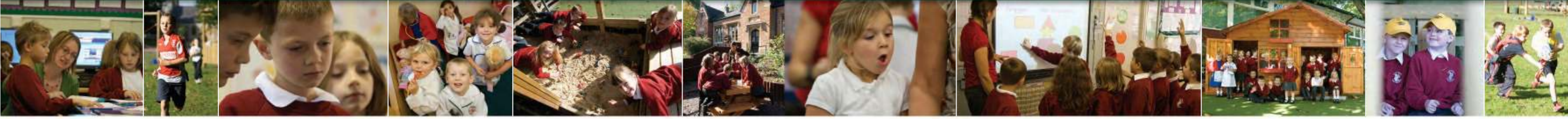
We love to go into the community and perform our songs and plays. We do our best to fund raise for local, national and international projects.

This is only a brochure, to get a real feel for the school you need to visit and see for yourself that we really are a hard working but friendly 'fun' school.